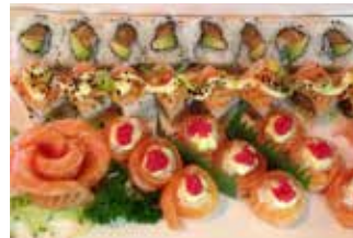
Roses platter R259