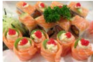
Rainbow platter R169