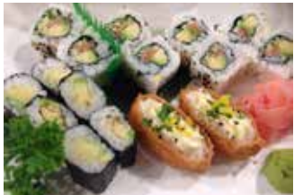
Vegetarian platter 16pc R75