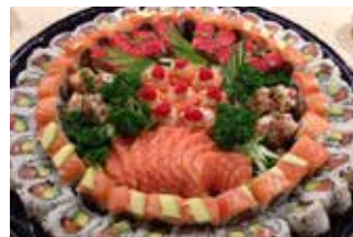
Yokohama 93pcs R820