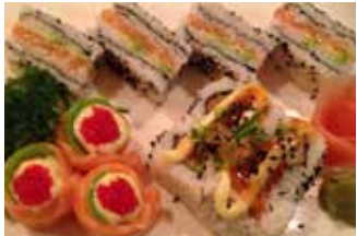
Lunch platter 10pc R109