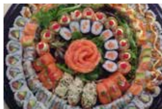
Mixed 100pcs R820