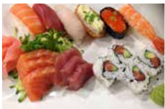
Umami platter R159