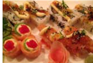
Tempura platter 13pc R149