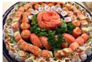
Tempura 100pcs R820