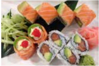
Assault platter 10pc R87