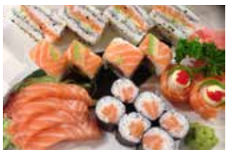
Mixed platter R165