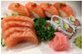
Salmon platter 12pc R149